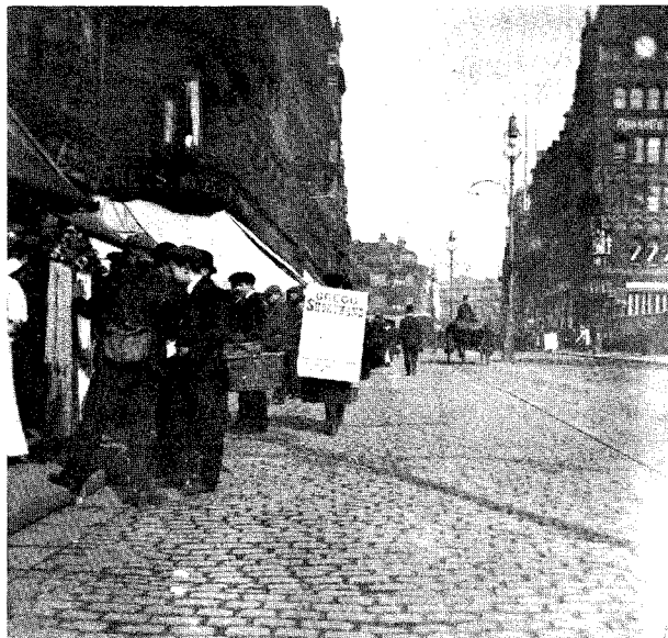
A sandwich board advertises Gregg Shorthand on Church Street in Liverpool, England. Circa 1888.