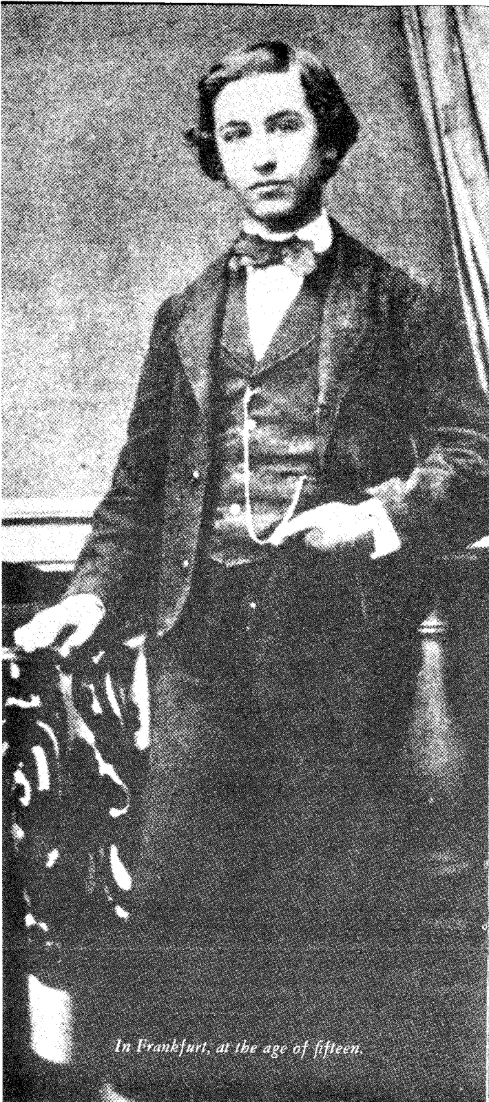
In Frankfurt, at the age of fifteen.