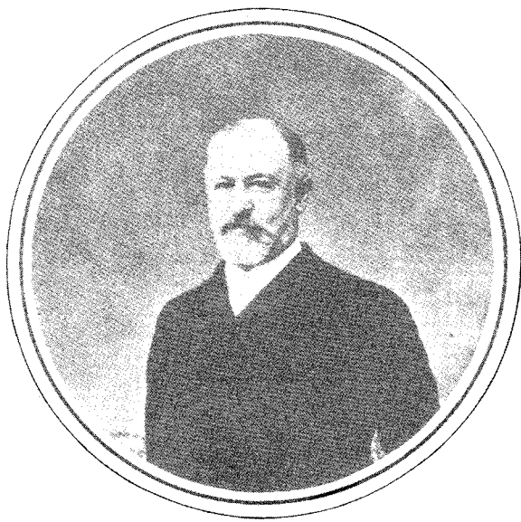
Jacob Schiff at the age of forty.

stopping. Jacob was not prepared to lose his daughter so easily. When the Schiffs and the Warburgs met in Brussels before the Schiffs' return to the United States, it was decided that Felix and Frieda were not to be allowed to correspond directly, but that they might write to each other's parents. With that clearly understood, the couple parted. But love eventually conquered. Six months later, Felix arrived in New York and went to work at Kuhn, Loeb. On March 19, 1895, Felix and Frieda married.