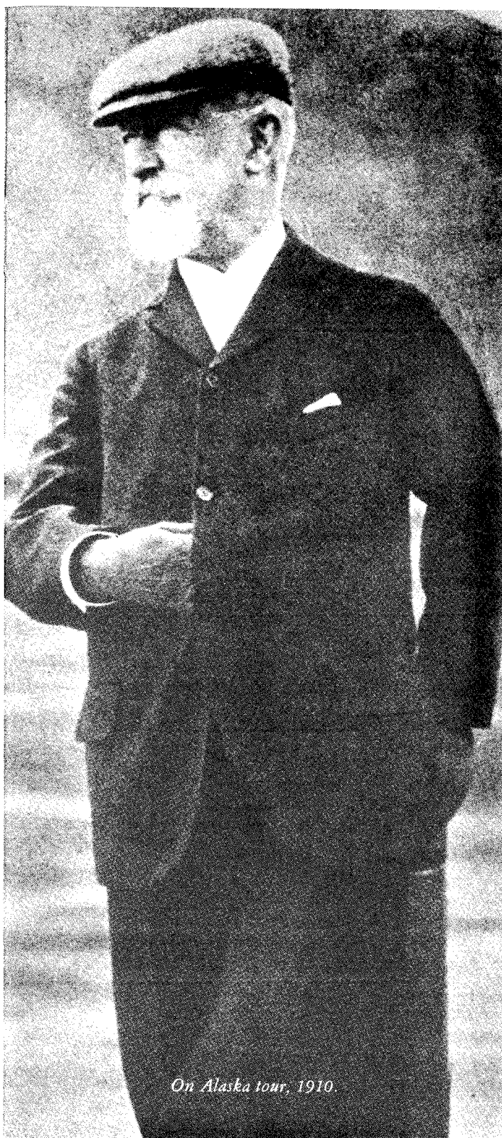
On Alaska tour, 1910.

During one of the summers in Germany, when the Schiff children were still quite young, Jacob began to give each of them an allowance of fifty pfenning a week — 12½ cents in American money. When they returned home, Frieda and Morti were required to keep track of which were the twelve-cent weeks and which were the thirteen-cent weeks. In addition, the Schiff children had to set aside a tenth of their "income" for charity — the Fresh Air Fund.